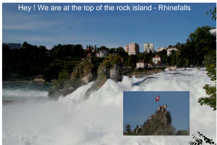
Hey ! We are at the top of the rock island - Rhinefalls

2015 This evening, it is essential that the tour manager knows the number of you who will be participating on the trip to the snow mountain. (Breakfast / Western Dinner)