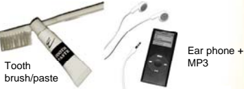
Tooth brush/paste Ear phone + MP3