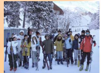
We are all ready for snowy hills