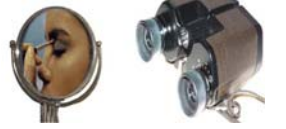
Small mirror Binoculars

personal hygiene products, travel sickness pills, mobile phone, hair lotion, personal soap, you may wish to pack also the following, that will certainly enhance your tour enjoyment.