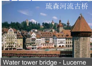
Water tower bridge - Lucerne