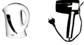
Small kettle Hair dryer